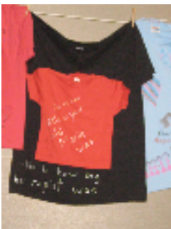
Contrasting Tees—the larger one is the rapist the smaller one the child who was raped and killed. This was a humbling display.