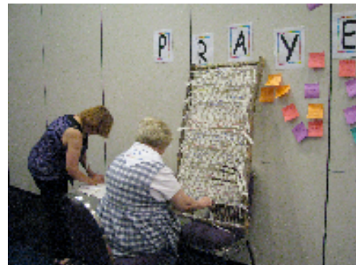
Prayer Shawl in the Spirituality Room